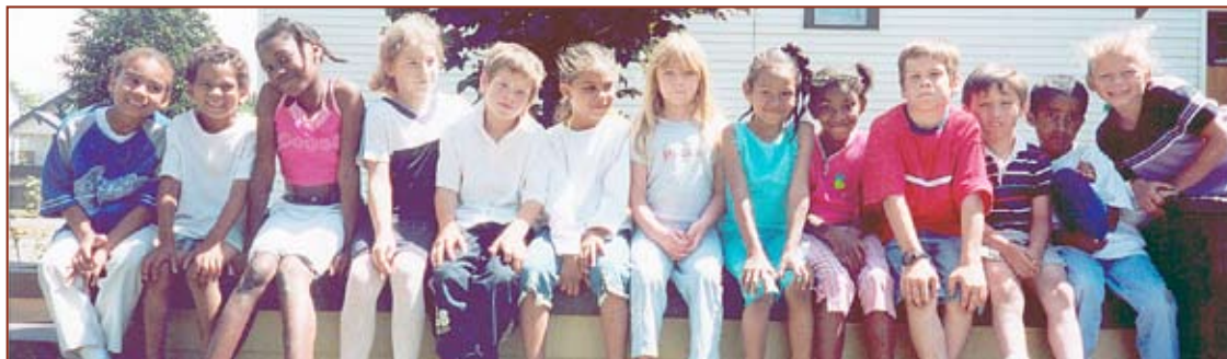
Elementary students enjoy a day at Camp Peace, our five-week summer day camp that focuses on academic support and enrichment activities.

Empowerment: We value our community's capacity to create positive change, and we commit to the development of leaders who reflect our community's diversity.